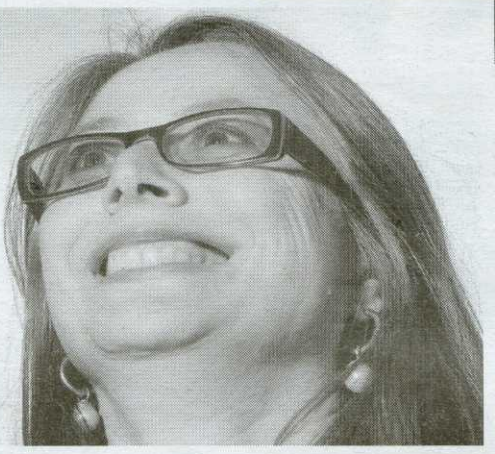
The Visionary » 13